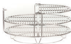
Divide & Conquer® System