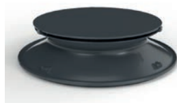
Patented Hyperbolic Insert