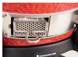
Patented Ash Collector