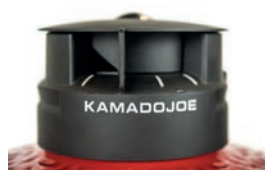
Control Tower Top Vent