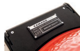
Air Lift Hinge