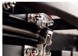
Stainless Steel Latch